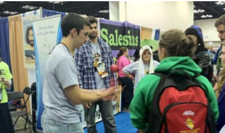
Pre-novices demonstrate the magic of juggling